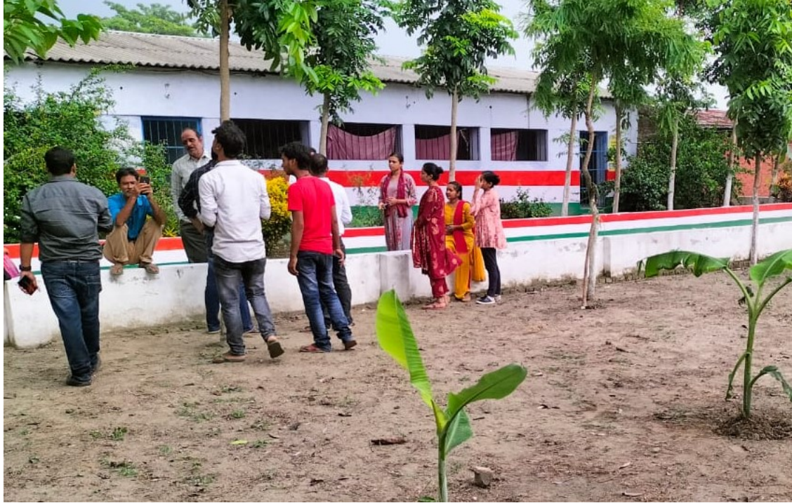
Banana Farming being practiced by the enrolled students in College Campus.