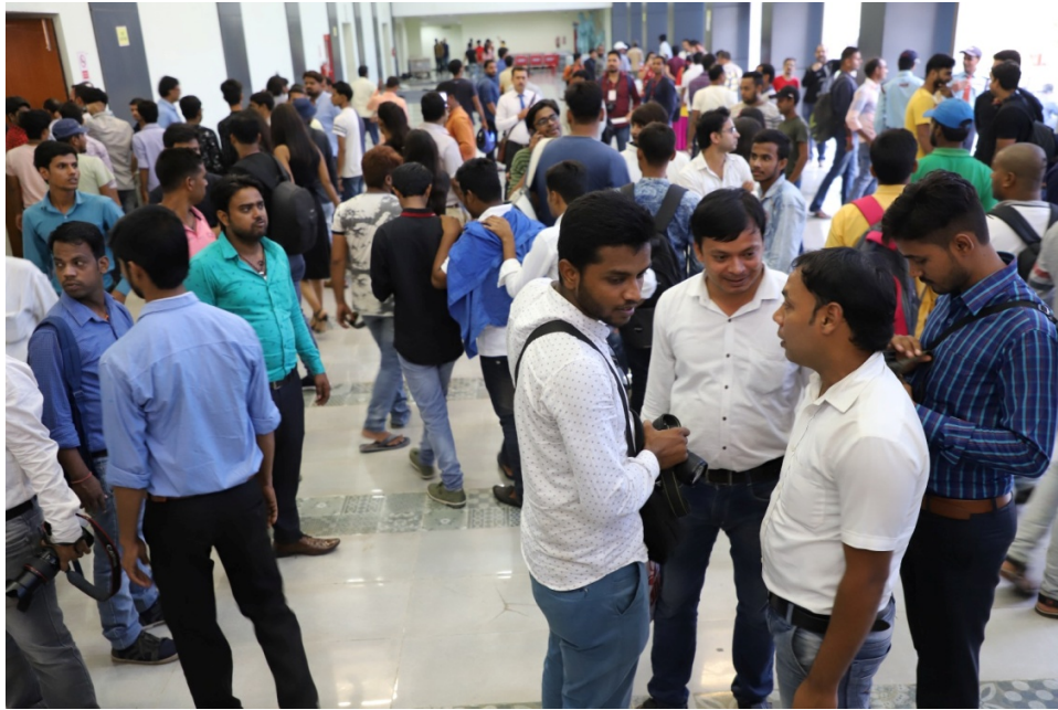
Bihar Photographer's association is a photography competition