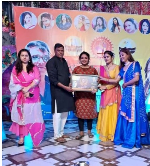
Students participating and receiving certificate