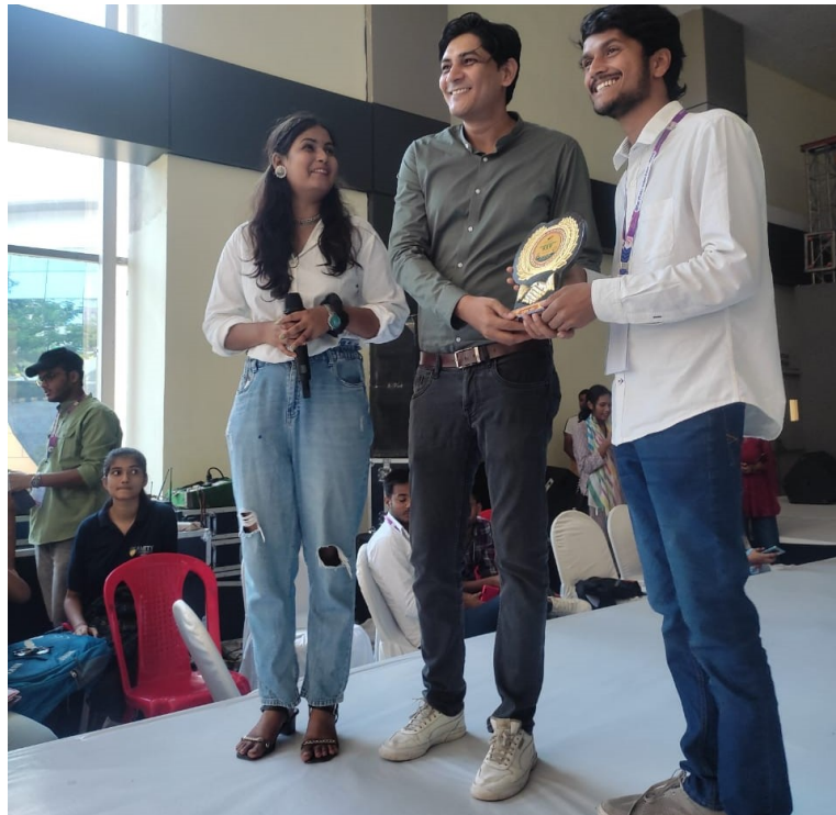
Presentation Ceremony in BPV Expo Date: 23-09-2019 (2019-20)