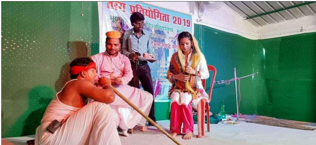
Students of UVK participating in drama event of Bihar State Inter University Cultural Festival