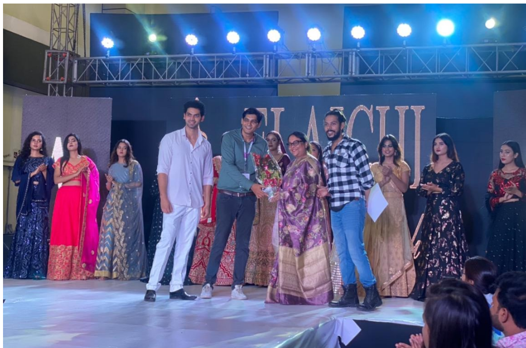
Award Ceremony Date: (22-10-2020) (2020-21)