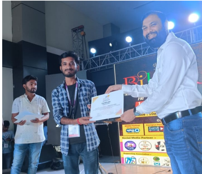
Students participating and receiving certificate