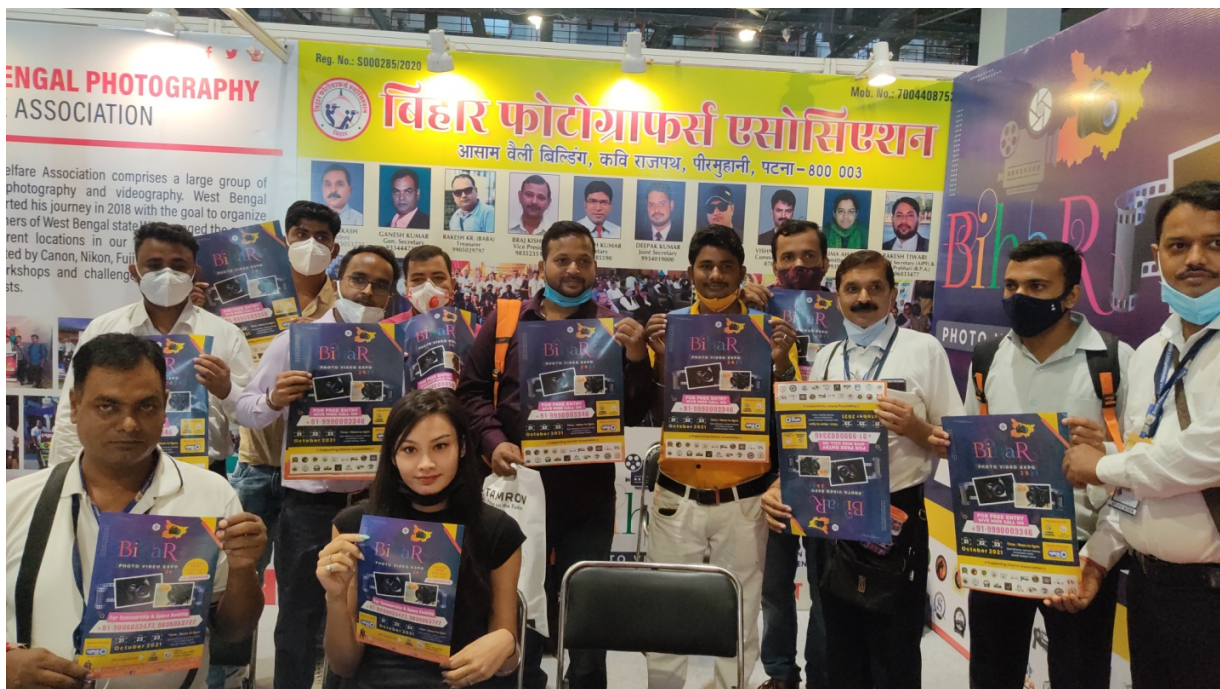
Bihar Photographer's association is a photography competition