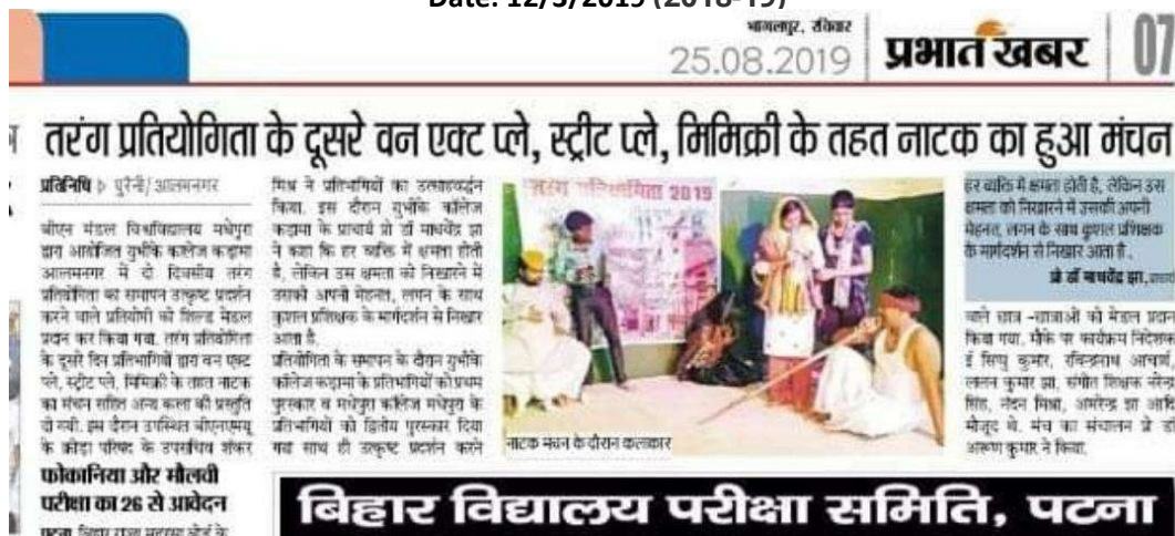
Paper Cutting of the news published about the event