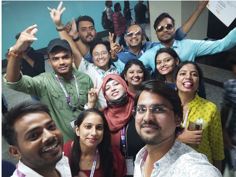
Students on final day of the event Date: (22-10-2021) (2021-22)