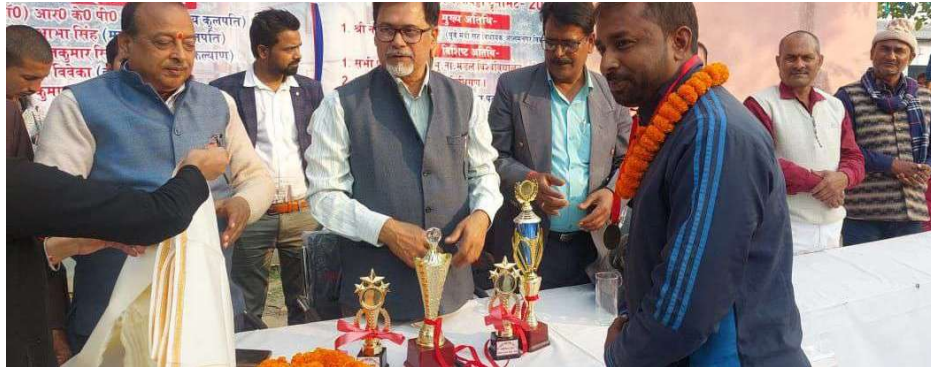
Inter-College Kabaddi Competition Date: 8/25/2019 (2019-20)