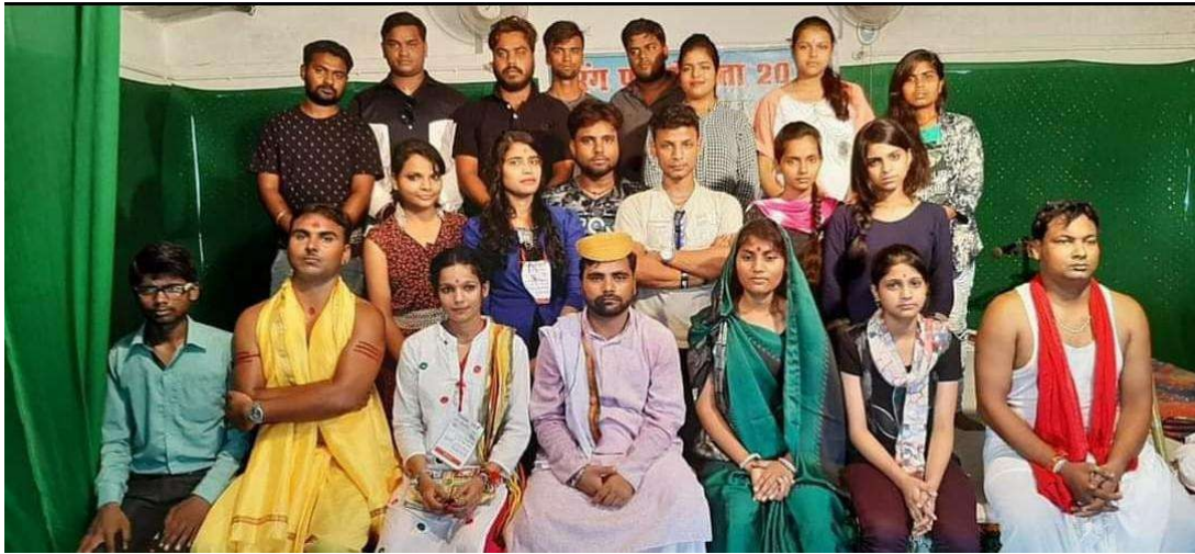
Students of UVK participating in drama event of Bihar State Inter University Cultural Festival