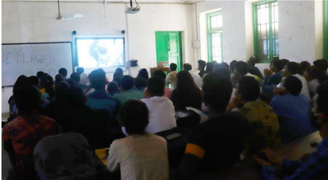
Participants from Career Building Seminar